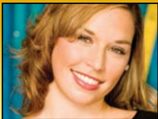
LIVE ENTERTAINMENT Page 2