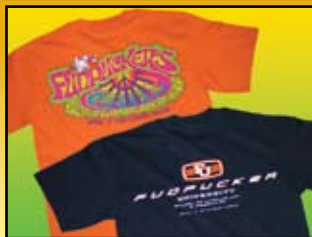
WORLD FAMOUS T-SHIRTS Page 13-16