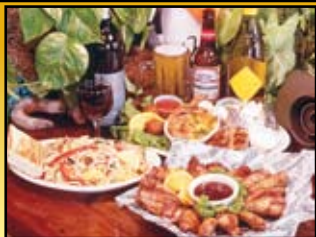
MENU OF ORAL DELIGHTS Pages 3-7