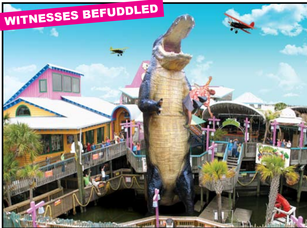
The moment in which the giant reptile had Father Fud in its grips was captured forever by photographer, Hugh Ephoe, who was trying to film some vintage bi-planes circling Fudpucker's when the incident occurred.