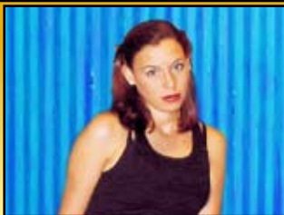
LIVE ENTERTAINMENT Page 2